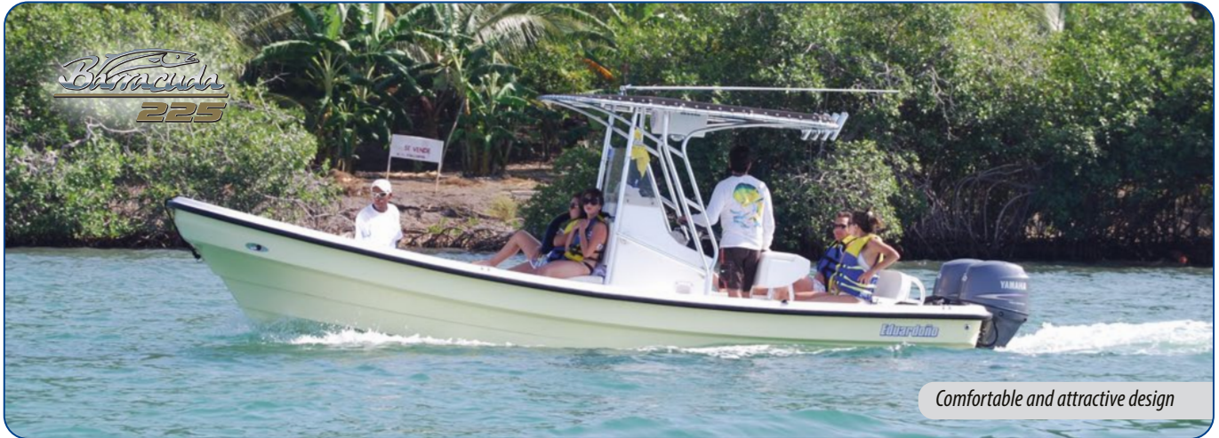
Comfortable and attractive design