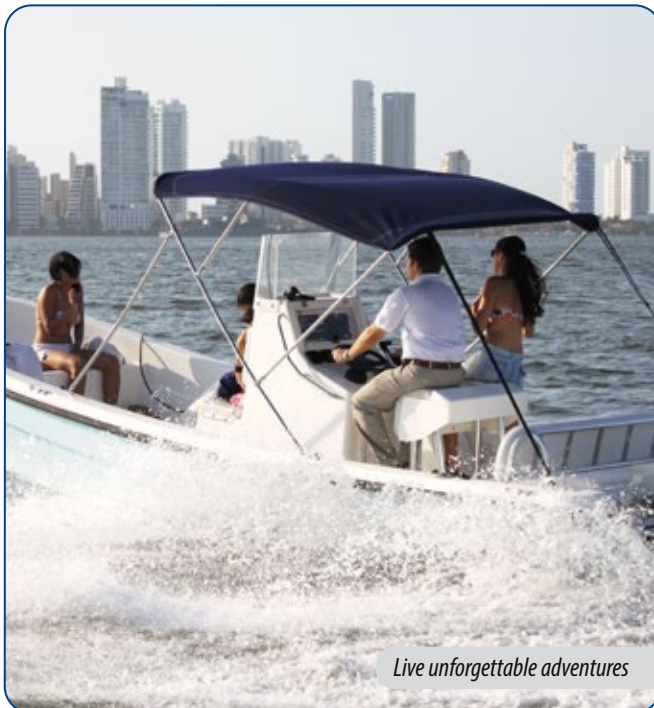
Live unforgettable adventures