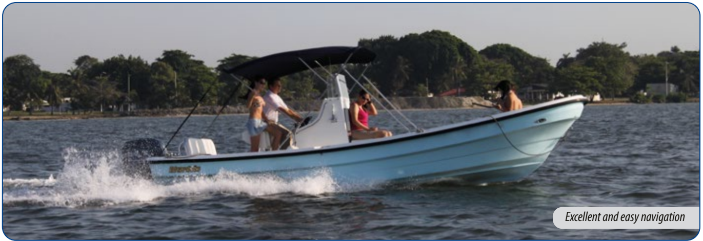
Excellent and easy navigation