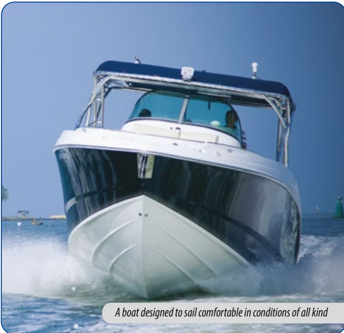
A boat designed to sail comfortable in conditions of all kind