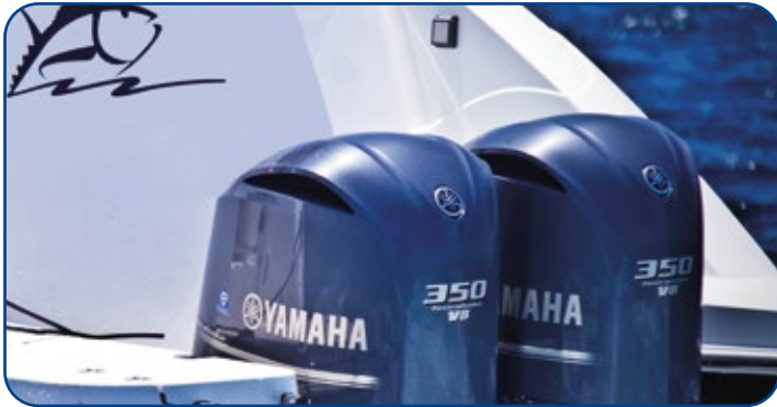
- 2 350hp engines as maximum capacity.