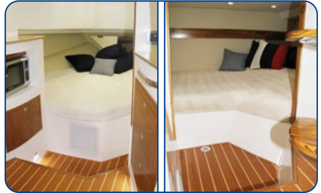
- Main and aft cabin.