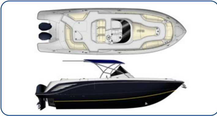
- Technical drawing TUNA 380.