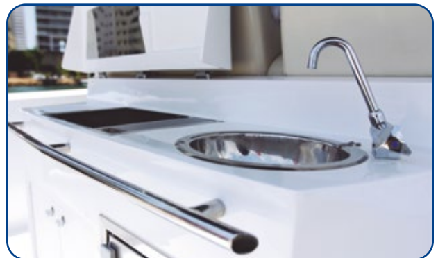
- Multi purpose compartment.