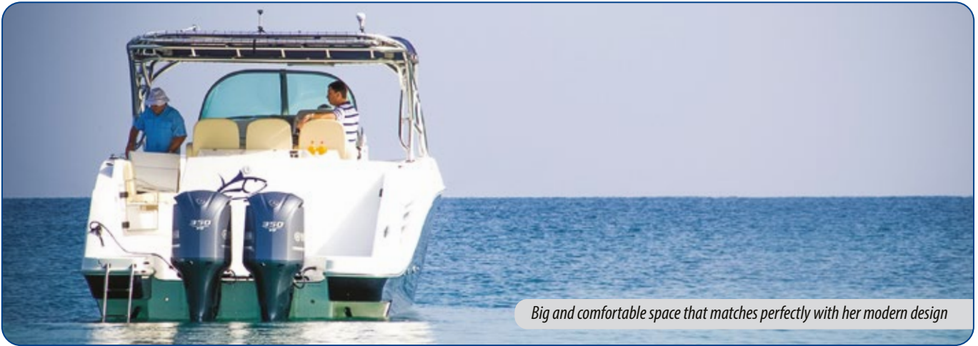
Big and comfortable space that matches perfectly with her modern design